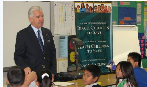
Rep. Jim Costa (CA-20)