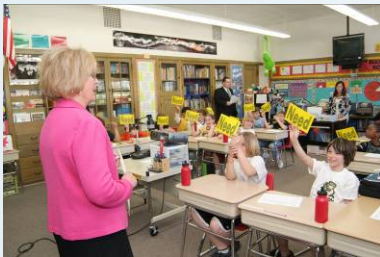
Rep. Judy Biggert (IL-13), Co-Chair, House Financial Literacy Caucus