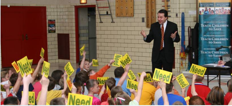
Rep. Pat Tiberi (OH-12)