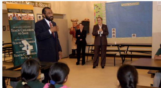
Rep. Al Green (TX-9)