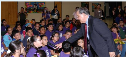
Rep. Ruben Hinojosa (TX-15), Co-Chair, House Financial Literacy Caucus